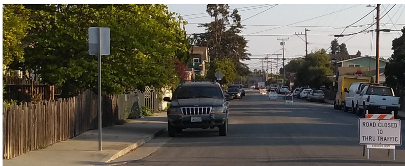
Bottom: May Ave. with Slow Streets signs.