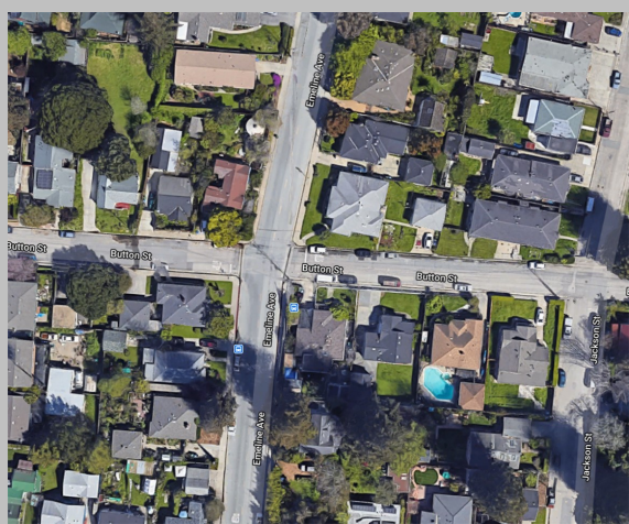
Red curb will be painted on the intersection of Emeline & Button.

There will be a two week public notice for the red curb. If there is no appeals the curb will be installed soon after the weeks. However, since the city is backed up with work, it may take a month to install the new lane from Fernside St. to Grant St..