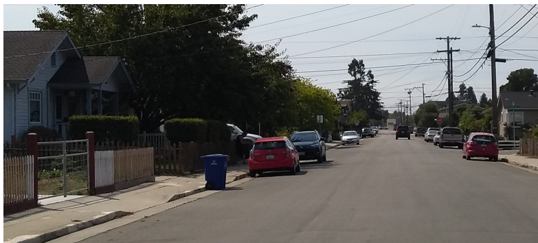
Top: Section of May Ave. before Slow Street implementation.