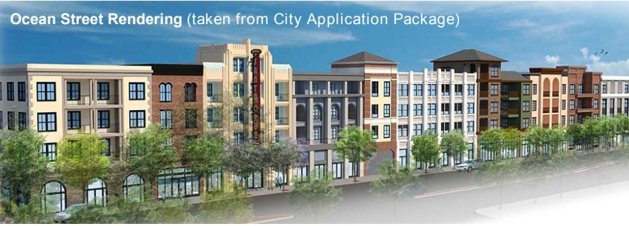
Ocean Street Rendering (taken from City Application Package)