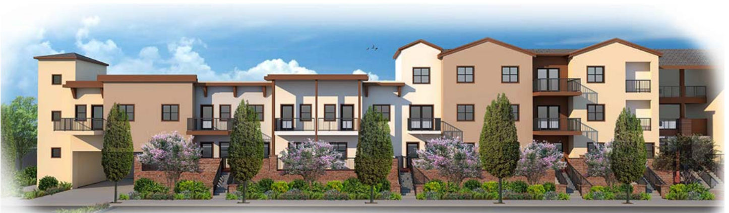
May Avenue Elevation (taken from City Application Package)

https://www.cityofsantacruz.com/government/city-departments/planning-and-community-development/active-planning-applications-and-status/908-ocean-street