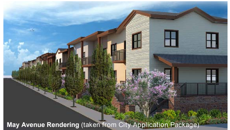
May Avenue Rendering (taken from City Application Package)

After lengthy discussions at the last Zoom in the Park on June 27 and July 11, GPN now has a subcommittee for actions and communications in preparation, and if necessary reaction to the mixed-use development's impact on the immediate neighborhood. More information about the project can be found at the City's website here: