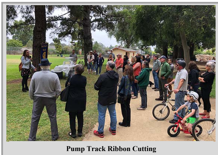
Pump Track Ribbon Cutting