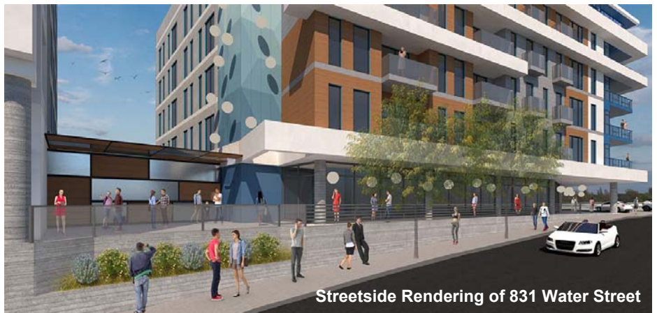
Streetside Rendering of 831 Water Street