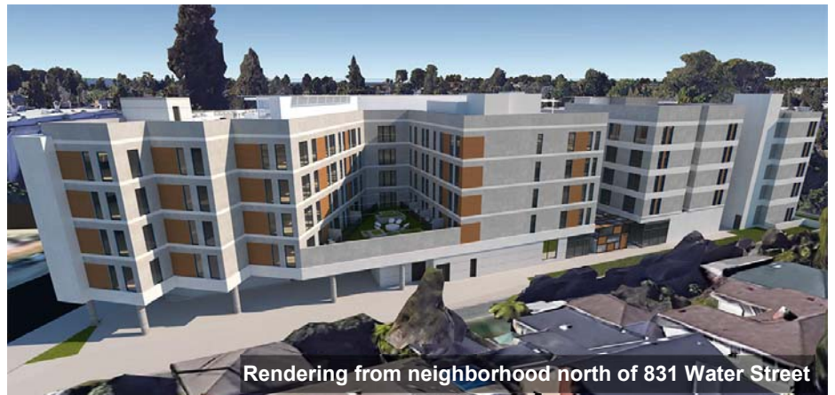
Rendering from neighborhood north of 831 Water Street

The applicant is requesting a maximum State Density Bonus of 35% pursuant to providing a minimum of 11% of the base density units as affordable to Very Low Income households, however applicant may provide as much as 51% of units as affordable to households between 30% and 80% of Area Median Income. A community meeting is forthcoming in the near future; the Community Meeting date, time and how to participate will be provided once a date has been officially set. Information on the development has been taken from the City of Santa Cruz website at https://www.cityofsantacruz.com/government/city-departments/planning-and-community-development/planning-division/active-planning-applications-and-status/831-water-street .